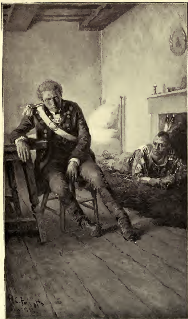
"He stared forward blankly at the inevitable prospect."